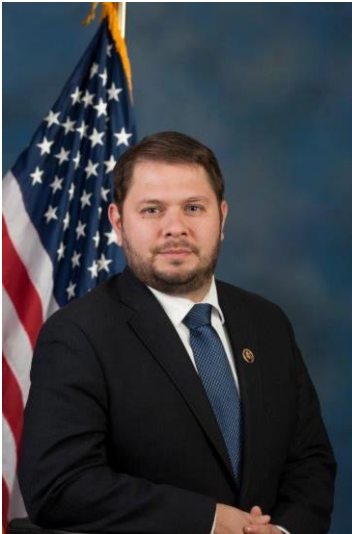
Ruben Gaellgo, U.S. Congressman

https://www.youtube.com/watch?v=WMxG6mVE5uQ&authuser=0