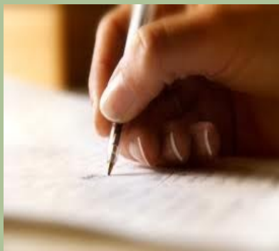
Students will learn about the content of each section of the test.